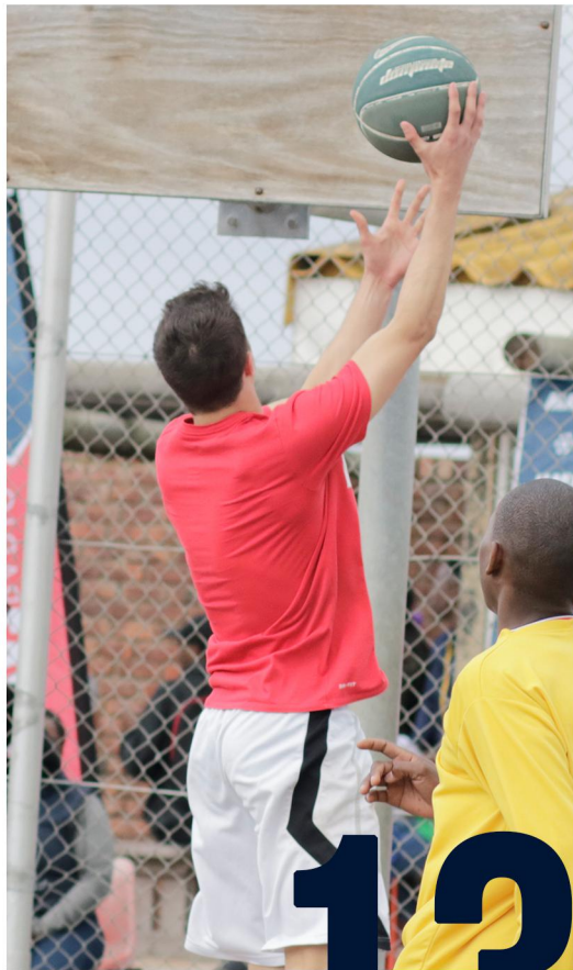
13 SPORTS DAY