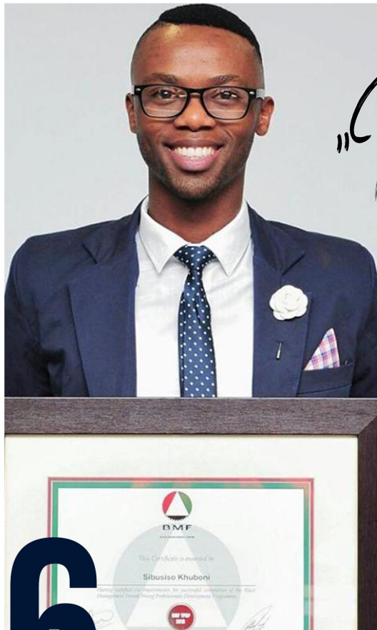
6 ALUMNI SPOTLIGHT