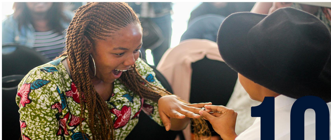
10 WOMXN'S SEMINAR