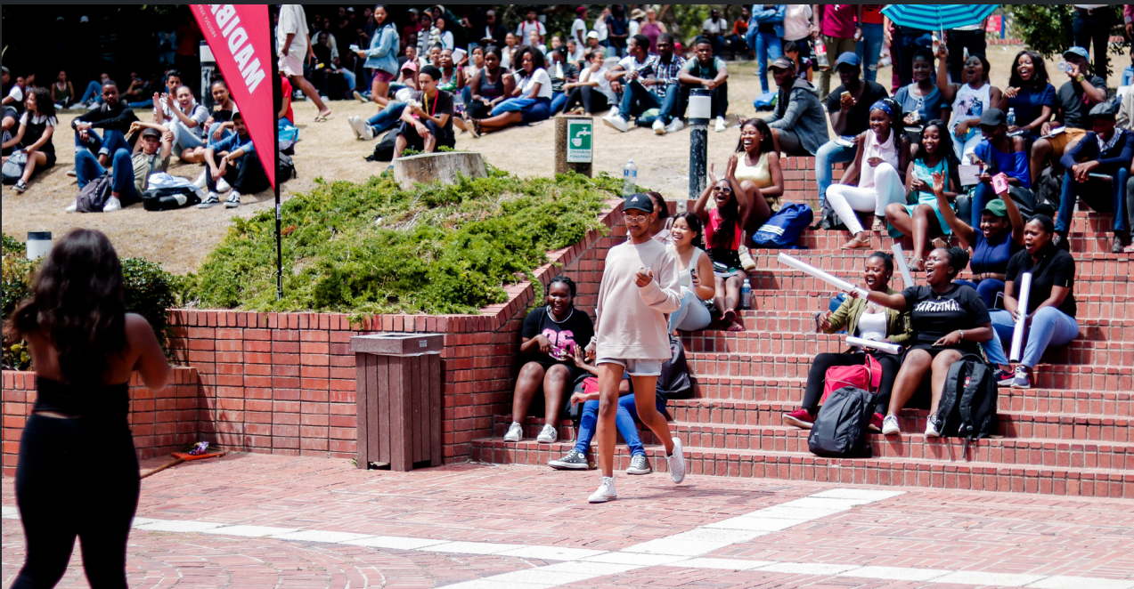
Presenters engaging with audience during MAKRO activation