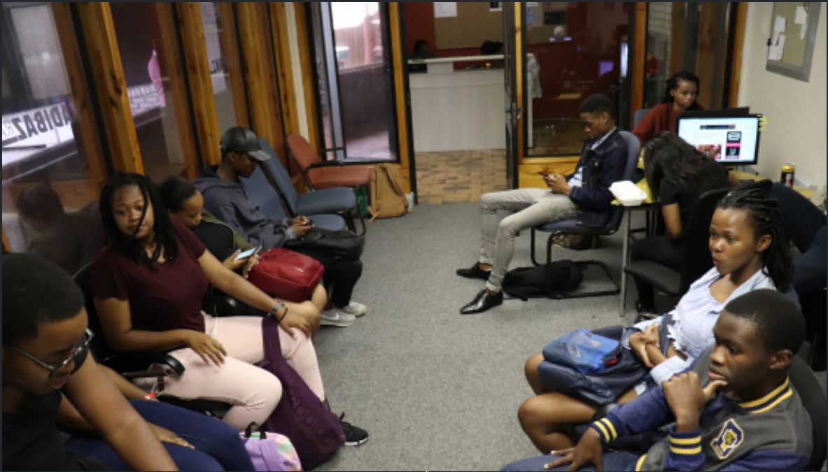
New hopefuls waiting for their chance to be interviewed