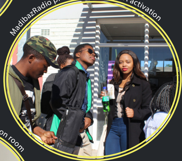
MadibazRadio presenters at the BLA activation