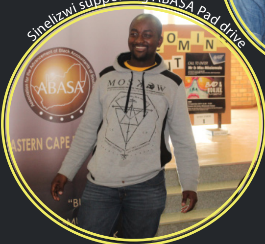
Sinelizwi supporting ABASA Pad drive